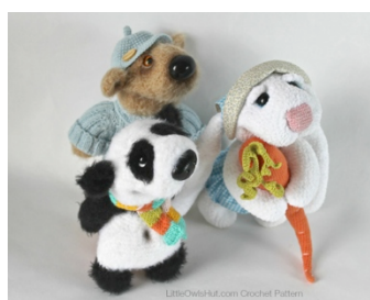
Panda, rabbit, bear

Crochet patterns available for sale at Little Owl's Hut www.LittleOwlsHut.com