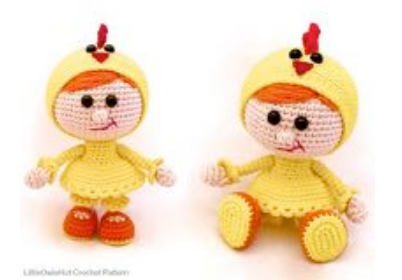
Doll in a chicken outfit

Crochet patterns available for sale at Little Owl's Hut www.LittleOwlsHut.com