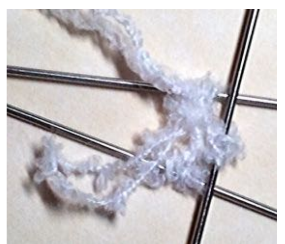
Rnd 1: K6 = 6 sts Rnd 2: KFB6 = 12 sts

The marker goes along the outer side of the piece. Cast on 6 sts and divide them between three doublepointed needles.