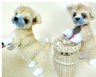
Shih Tzu dog