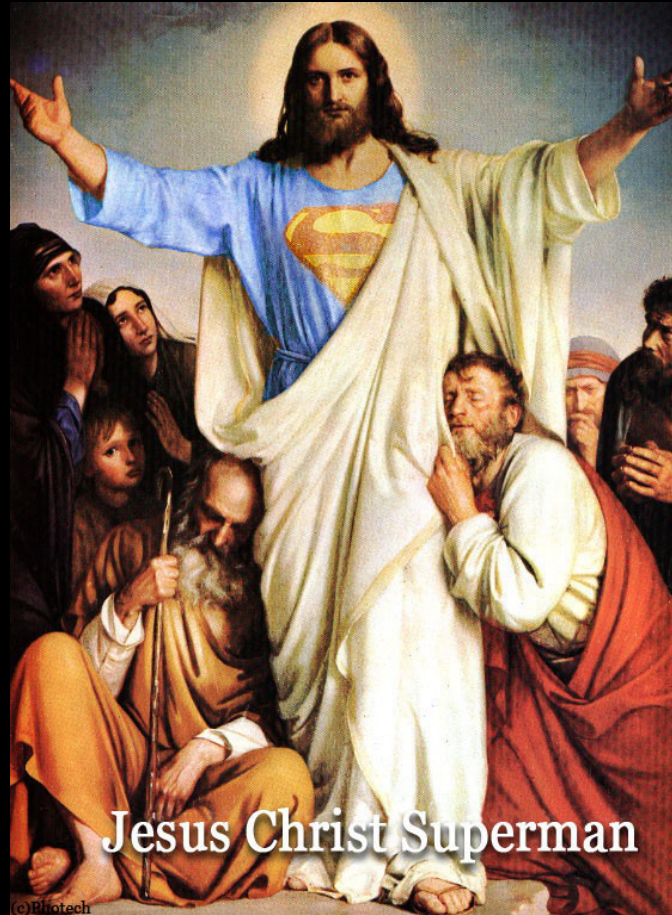
Jesus Christ Superman