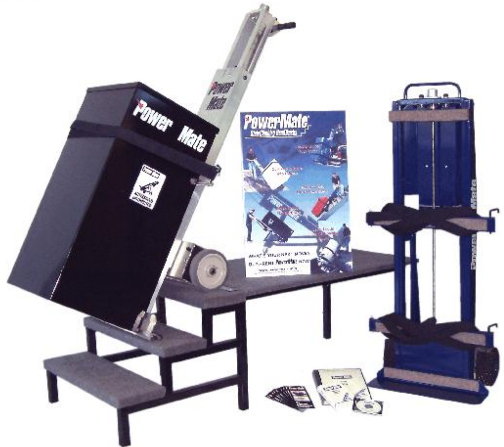
Example (Package above)