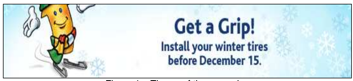
Figure 1 – Theme of the campaign

With a touch of humour, the messages drew a parallel between driving on an icy or snowy surface and figure skating (Figure 1). A commentator described the sliding of a vehicle that causes an accident because it is not equipped with winter tires. The messages also specified that, in order to avoid breaking the law, it was mandatory to equip vehicles with winter tires prior to December 15.