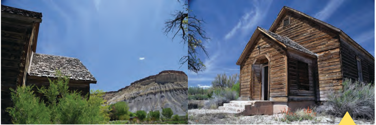
Old Meeting Hall (Caineville)