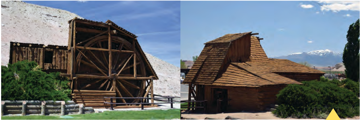
The Wolverton Mill (Hanksville)