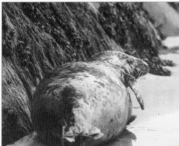
Marine mammals can store PCBs at highly concentrated levels. The results have been catastrophic.

year, four hermaphroditic cubs have been seen – the highest tally so far – and researchers fear that up to four per cent of the bears may be affected. The Norwegian Special Adviser on polar affairs has pointed out the findings' implications for other life forms, including humans: "The polar bear, like us, is at the top of the food chain. We are very concerned," he said. 14