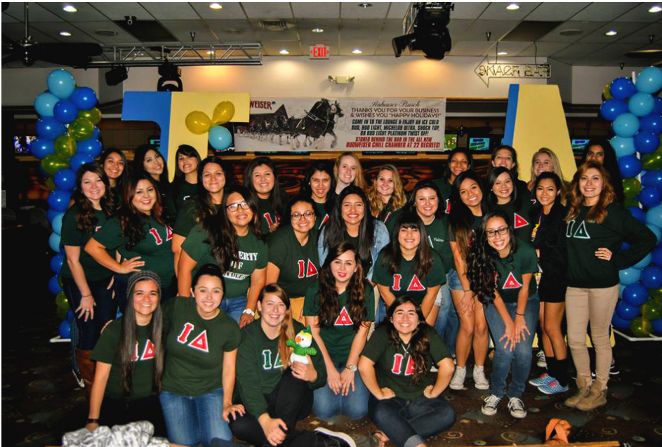
At our Bowl for Breathe philanthropy event at Chaparral Lanes in San Dimas.