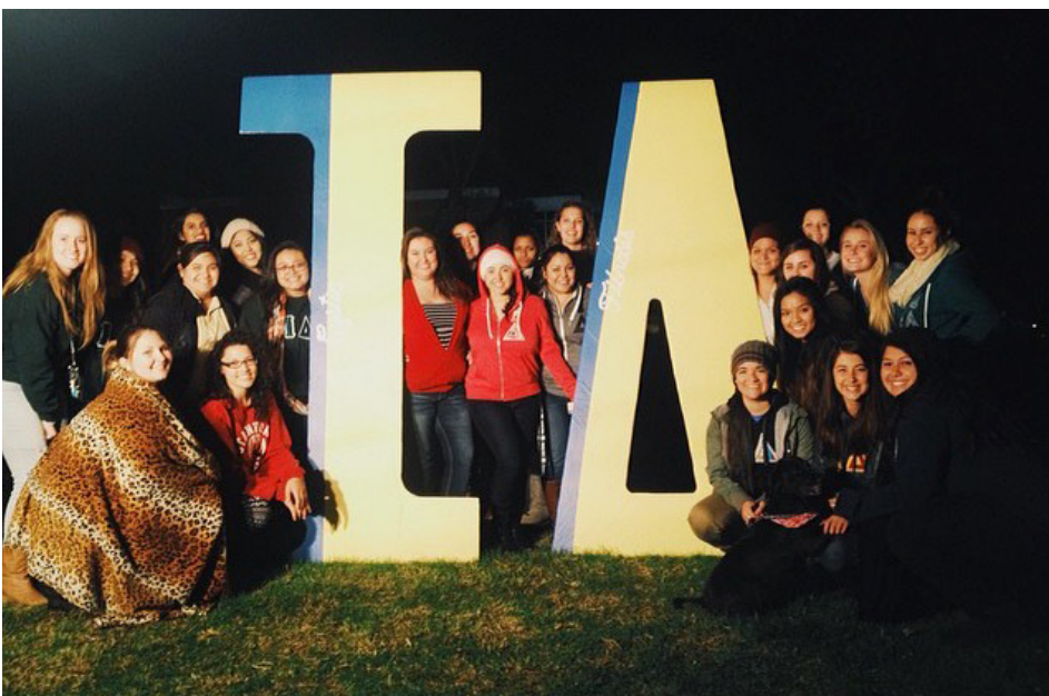
At our 24 hour Jump-a-thon event during Cystic Fibrosis week.