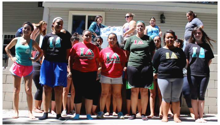
Iota Delta supported ALS by participating in the Ice Bucket Challenge during summer retreat.