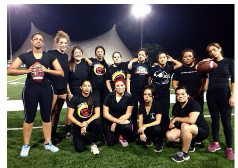
Iota Delta keeps it intra-fraternal with other female organizations in the powder puff game.