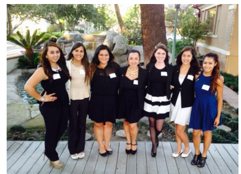
Some sisters of Iota Delta were invited to the university president's home for a leadership dinner.