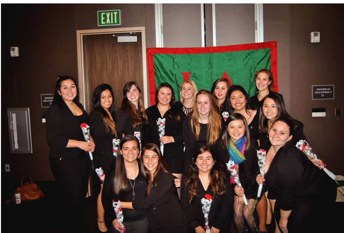
These are newly elected executive board and chair positions for the new year/semester.