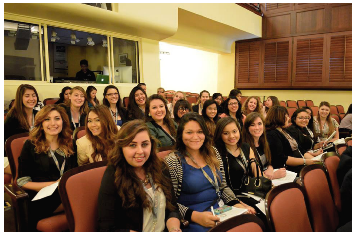
Sisters of Iota Delta participated in the all Greek conference that was hosted at the University of La Verne.

Photography provided by Greek Conference